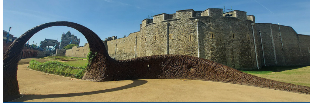
Tower Super Bloom

And a big thank you to The Comet newspaper for their continued support.